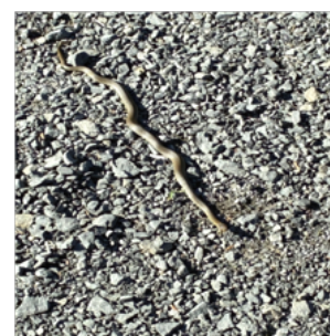
Hiking surprise before the wedding (the Eastern Brown – the #2 most venomous snake in the world!)

Speaking of expecting couples, our daughter and son-in-law, Sara and Sid, are expecting their first child (our first grandchild!) in early July.